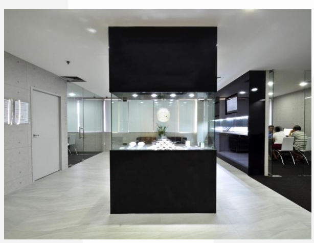
Silver Bullion's retail office at Certis Ciso Centre

Silver Bullion Pte Ltd, having more than 350 Million SGD in total revenue, was ranked 33<sup>rd</sup> among Singapore's E50, which includes the most enterprising privately held firms in the city-state according to KPMG and The Business Times .