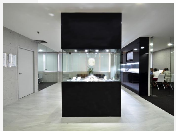
Silver Bullion's retail office at Certis Ciso Centre

Silver Bullion Pte Ltd, having more than 300 Million SGD in total revenue, is now ranked 33<sup>rd</sup> among Singapore's E50, which includes the most enterprising privately held firms in the citystate according to KPMG and The Business Times .